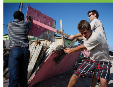
Build permanent housing in South African townships