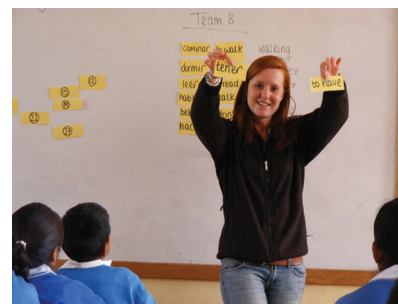
Teach English in the Sacred Valley of Peru

Recruiting volunteers from around the world, Projects Abroad sends thousands of volunteers away each year to a wide array of projects across the developing world. Founded in 1992, Projects Abroad operates in 30 developing countries and supports over 1000 unique projects, from humanitarian-based projects such as Care, Teaching, Conservation and Human Rights to internships in Law, Journalism and Medicine. Projects Abroad offers safe, sustainable, constructive and worthwhile projects, which allow volunteers to make a positive impact and form a genuine connection to the community or environment in which they work.