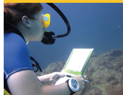
Protect marine ecosystems on a tropical Cambodian island