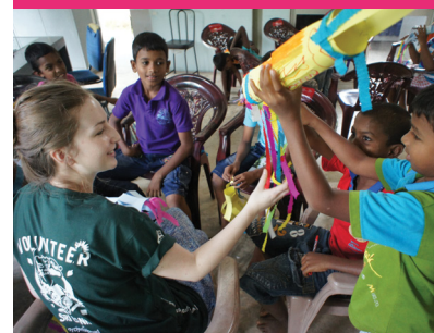
Support and care for disadvantaged children in Sri Lanka