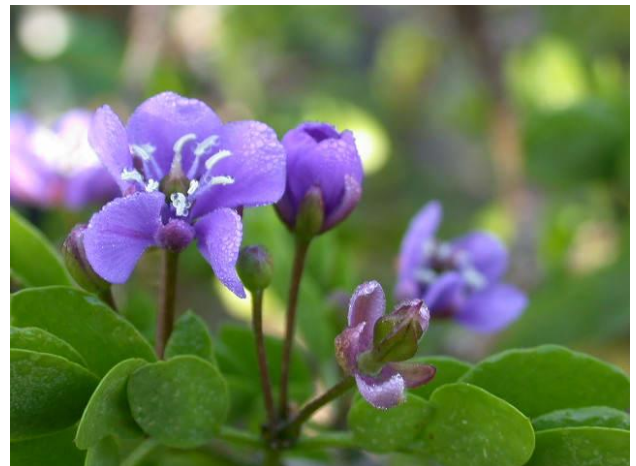
Jamaica's National Flower - Lignum Vitae

Website: www.projects-abroad.net Facebook group: Projects Abroad Jamaica Blogsit: http://blog.projects-abroad.net/mytriblog.org