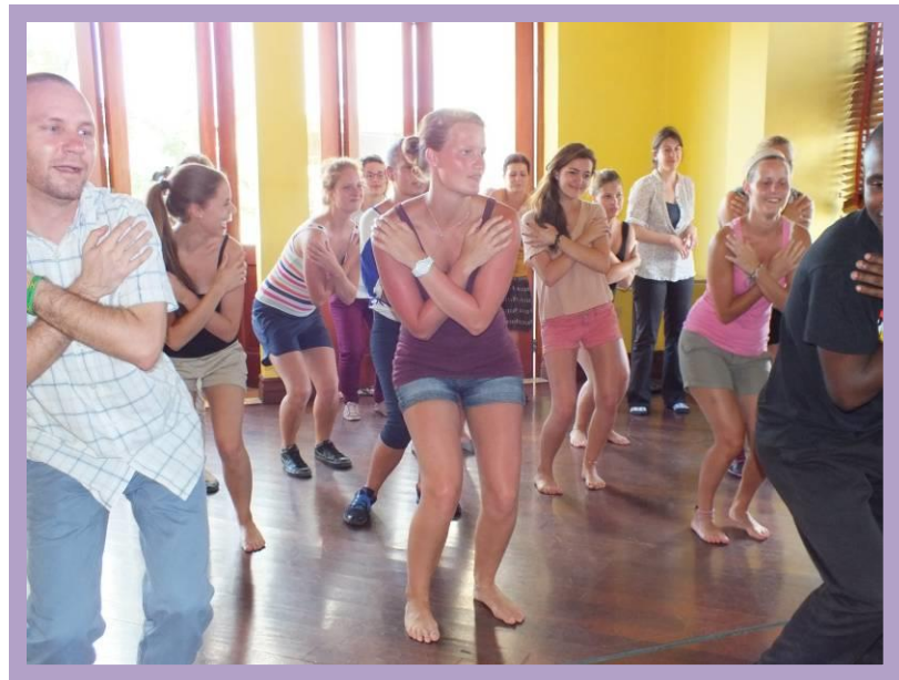
Volunteers practicing dance routine at Reggae Dance Class

The class began with warm-up exercises designed to enhance flexibility which created the perfect segue into the dancing lessons to some truly old school music that would have anyone rocking to the beat. After some old school music we moved the beat back to modern day dancehall and had volunteers working up a sweat.