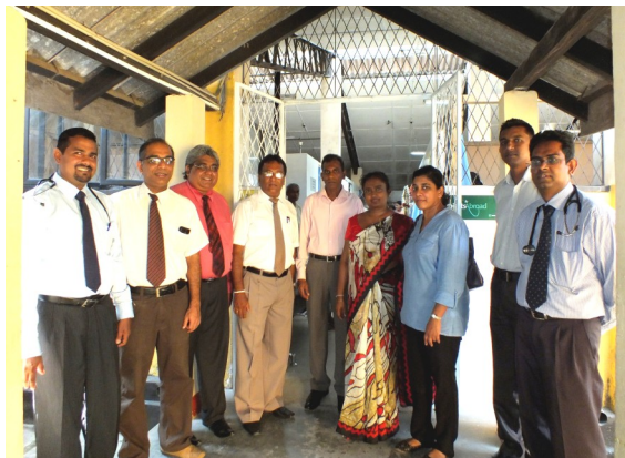
Doctors and Projects Abroad Staff

Projects Abroad funded the renovations of a dilapidated hospital building and turned it into a place where daily clinics can be conducted within the Panadura Base Hospital. The hospital was officially handed over to the doctors on the 12 th of March 2014. It auspiciously started with a small ceremony with lighting the traditional oil lamp