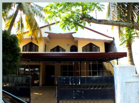
The new IT center

At this center, the IT education is free for every student and finally they will receive a valuable certificate.