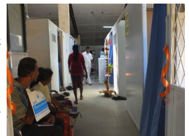
The clinic cubicles

and blessings from a Buddhist monk. As part of the renovations, we also made several clinic cubicles inside this premise to conduct daily clinics for the various patients. This will