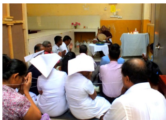
A Buddhist monk was chanting blessings

Doctors at the event praised the Projects Abroad Sri Lanka office for its continuous assistance at the hospital. This is one of the placements for the medical interns.