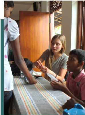
Merle in action