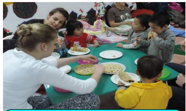
Pancake Day organized by volunteers at Bo De placement. The children had the chance to decorate and eat their own cakes!