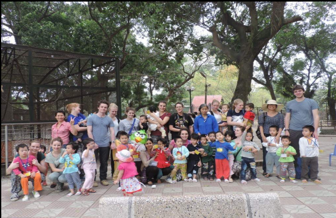
Zoo Day for orphaned children—Outreach Event of March

Follow us on Instagram for the inspiring and thought-provoking photos and stories: Projectsabroad_Vietnam :)