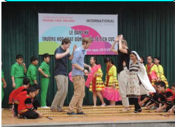
Our volunteers joined in a special Vietnamese dance performance in a special event at their placement.